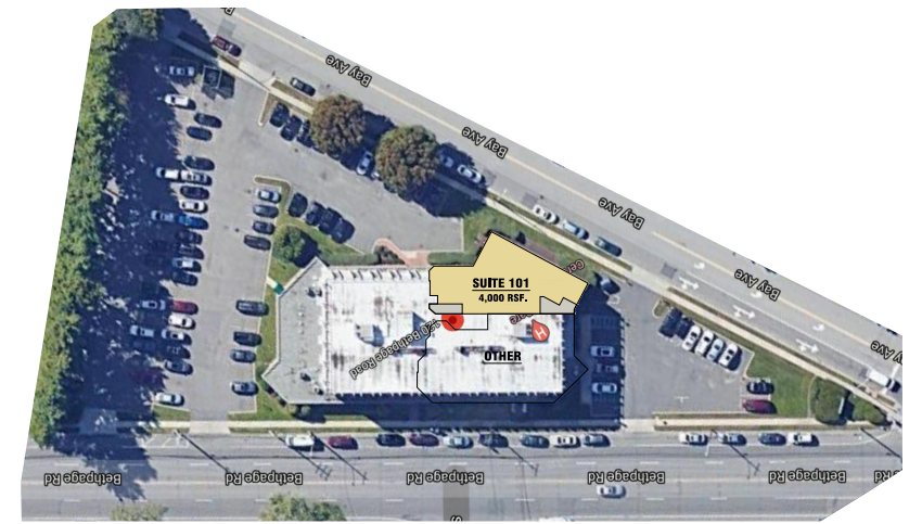
AERIAL LOCATION DIAGRAM NOT TO SCALE